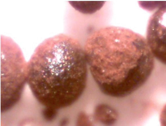
Clear Shot 2Fg, graphite coating removed.

With the candy making machinery, using a slurry, the resulting grains become nearly spherical in shape. The grains are then given a graphite coating.