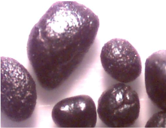
Clear Shot 2Fg at 60X.

Clear Shot was little more than a modification of various sugar-based powders that date back into the late 19 th century. The “modern” approach being mainly the idea of producing the powder from a slurry, rather than from a melted, molten state, using up to date candy making machinery.