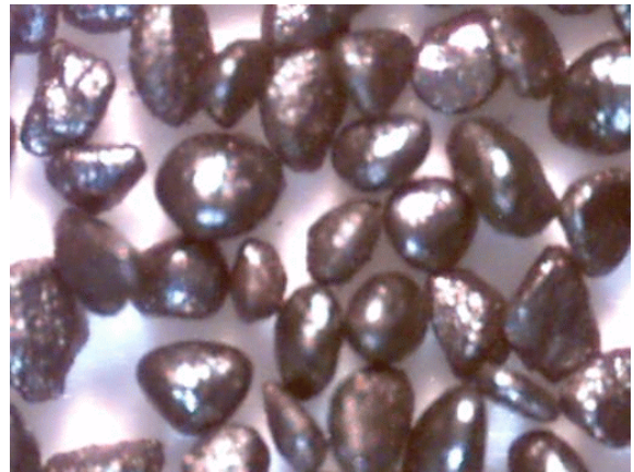
Clear Shot 3Fg at 60X.